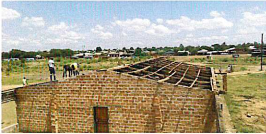
Replacing a collapsed roof

Thank you for your support of the ministry!