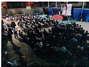
Fires of Evangelism

We also hosted a Fires of Evangelism conference and a Youth Conference at the same time here at Efata. What a blessing that was. Over 150 people made professions out on visitation and in the conferences itself. At least 19 adults and 59 young people surrendered for full time Christian service. The youth conference was administered by the missionaries of Team Peru from First Baptist Church of Hammond. It is so nice to have a strong friendship and ministry environment with other missionaries of like faith. We averaged 600 people in the evening services with the largest service being 636 people. There were over 300 during the daytime sessions and at least 45 pastors came to the conference.