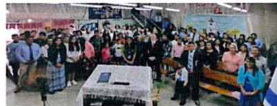
The Tablada Mission Church