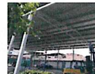
Work on the Roof